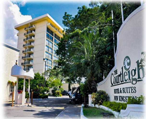
THE COURTLEIGH HOTEL & SUITES