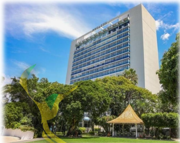
THE JAMAICA PEGASUS HOTEL

Services provided to media at venue includes Wi-fi Internet access